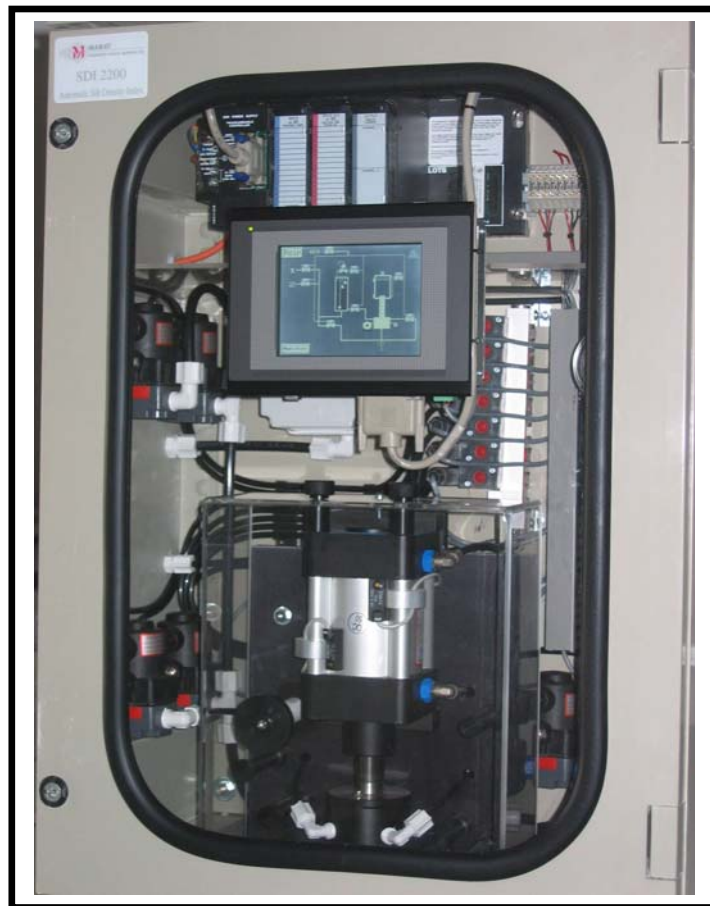
SDI-2200 Silt Density Indexing Unit Serial No.: 25145